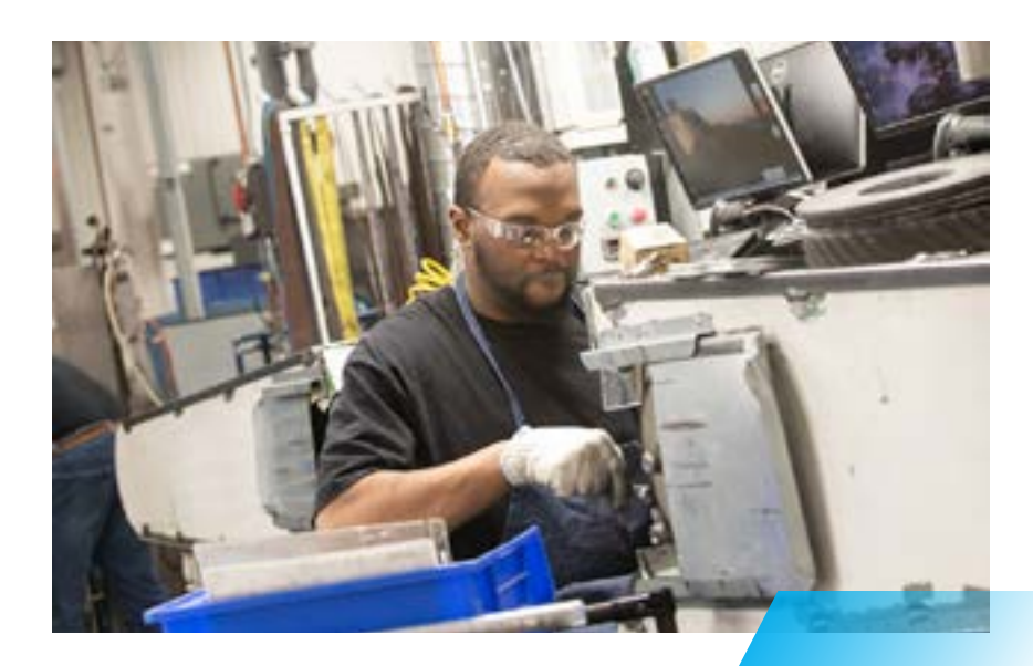
Zimmer Biomet seeks to outperform its competition fairly and honestly.

Team members and business partners are also prohibited from collaborating with a competitor or from taking actions that could have an improper anti-competitive effect without preapproval from Legal.