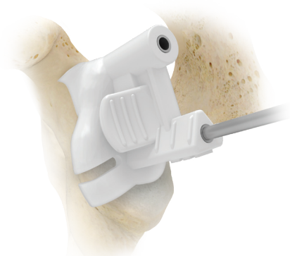
1. Pin Guide

with an extensive patient specific guides portfolio