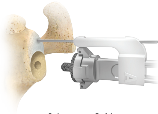
3. Impactor Guide