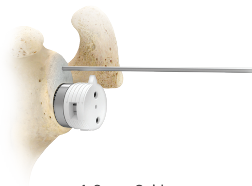
4. Screw Guide

Confidence to reproduce the pre-operative plan