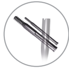
Lag Screw with Anti-Rotation Screw