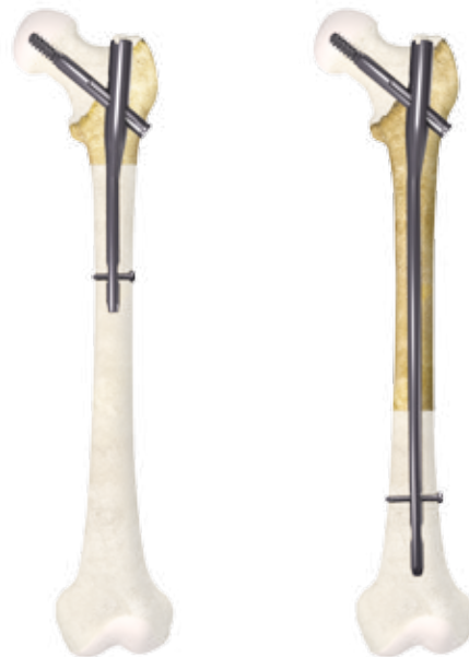
Short (180 mm)

Benefit: Ability to customize the procedure